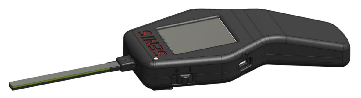
Figure 3: SENIS 3MH1 Handheld Teslameter without the nose cover