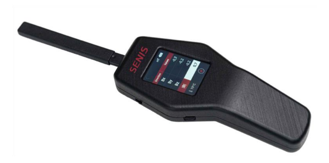
Figure 1: SENIS 3MH1 Handheld Teslameter

Due to unique features of the applied fully integrated 3-axis Hall probe, all three components of the magnetic field (Bx, By, Bz) are measured simultaneously at virtually same point. It allows users to perform a fast, high-resolution measurement of magnetic flux density of the magnetic fields. The measured values are presented on the device touch-display. The magnetic field sensitive area of the applied Hall probes is within a 100 \mu m x 100 \mu m square, which allows measurements of homogeneous and highly inhomogeneous magnetic fields.