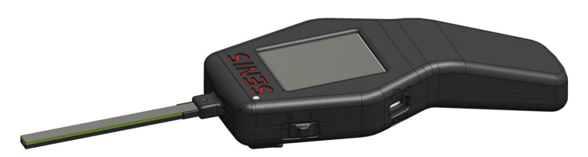
Figure 3: SENIS 3MH1 Handheld Teslameter without the nose cover