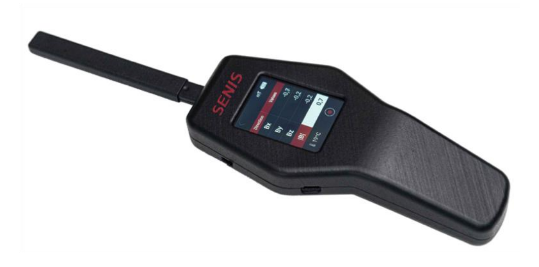
Figure 1: SENIS 3MH1 Handheld Teslameter

Due to unique features of the applied fully integrated 3-axis Hall probe, all three components of the magnetic field (Bx, By, Bz) are measured simultaneously at virtually same point. It allows users to perform a fast, high-resolution measurement of magnetic flux density of the magnetic fields. The measured values are presented on the device touch-display. The magnetic field sensitive area of the applied Hall probes is within a 100 \mu m x 100 \mu m square, which allows measurements of homogeneous and highly inhomogeneous magnetic fields.